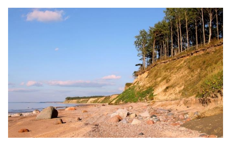
DAY 5 along the sea coast, keramics relaxation

Cliff of Jūrkalne , nice villages Sabile and Kandava in Abava river valley . Optional keramics workshop with black clay in Tukums.